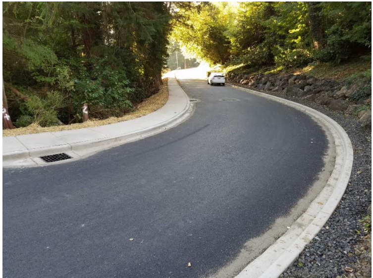
TBD-funded reconstruction of Arnold St.

A: The City's Engineering Department maintains a list of streets that have been identified by City staff, by the City Council, or by public comment as in need of repair or improvement. The streets on the list are inspected annually and their conditions are scored. The City Engineer then ranks the streets based on their scores and selects top-ranked streets for developing cost estimates. The City Engineer then assembles the annual project plan based on top-ranked streets and available budget, with an emphasis on providing a range of project types (large projects, small projects, sidewalks, crack sealing, etc.) over a broad geographical area, and avoiding funding projects with local TBD dollars that are eligible for state or federal grants.