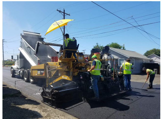
TBD-funded paving on Haight Street